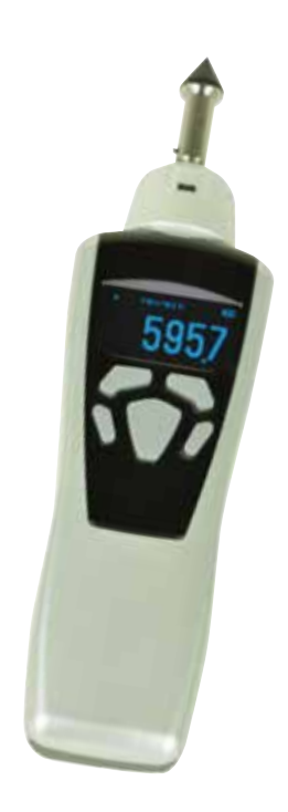
DT-2100 Shown with Contact Adapter & Cone